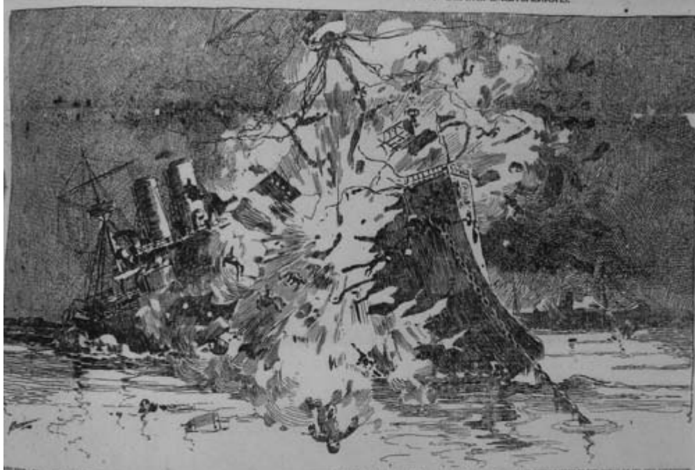
THE MAINE EXPLOSION AT SEA--RECORDED BY THE STEAMSHIP CITY OF WASHINGTON WHICH WAS THE ONLY ONE TO SURVIVE--POLLARD BY A VISUAL OF THE EXPLOSION OF MAINE, WHICH WAS SHOT BY THE SPANISH BATTERY IN THE BAY OF HAVANA, FEBRUARY 15, 1898. THE WICKED STORY OF THE MAINE TOLD IN A FEW WORDS. THE MAINE WAS SHOT BY THE SPANISH BATTERY IN THE BAY OF HAVANA, FEBRUARY 15, 1898. THE MAINE WAS SHOT BY THE SPANISH BATTERY IN THE BAY OF HAVANA, FEBRUARY 15, 1898. THE MAINE WAS SHOT BY THE SPANISH BATTERY IN THE BAY OF HAVANA, FEBRUARY 15, 1898.