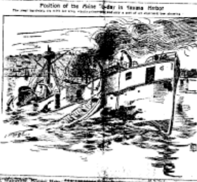
Position of the Maine Today in Havana Harbor.

England Believes It Foll. Play. The British cabinet has just received a report from the United States Consul at Havana, which is believed to be the latest and most reliable information received from that city. It is believed that the ship was destroyed by an outside attack, and that the Spanish fleet was in the vicinity of the ship at the time of the explosion.