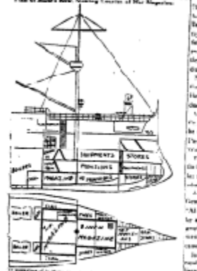
Plan of the Maine, Showing the Position of the Magazines, Gun, and Deck.

Washington, Feb. 16.—The President has just received a report from the United States Consul at Havana, which is believed to be the latest and most reliable information received from that city. It is believed that the ship was destroyed by an outside attack, and that the Spanish fleet was in the vicinity of the ship at the time of the explosion.